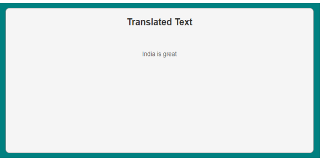
Figure 3: Output English Text

Output text: The translated text in English is what the machine translation system produces Based on the input given in figure 3.