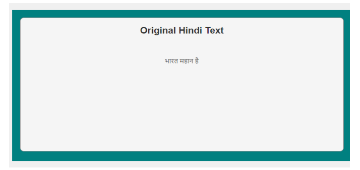
Figure 2: Input Hindi Text

Input text: The input for a machine translation system from Hindi to English consists of text or sentences written in the input Hindi Text (figure 2).