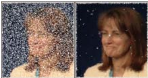
Figure 2 Noisy Video(left) and Filtered Video(right)

spatio-temporal sense. The best video de-noising may be achieved by exploiting information from each future and past frames. But this leads to a further delay of a minimum of one frame that is undesirable in some time period applications. For this reason, many algorithms exploit data from typically the current frame and one or 2 previous frames. In image frame de-noising algorithms focus to find the most effective compromise between noise removal and preservation of vital de-noised image frames. Here each frame is severally processed. That is why for optimal filter performance the spatio-temporal properties of the processed noisy image frames area unit taken into thought. The general framework for video de-noising is illustrated in Fig. 1. An correct modelling of noise is necessary so as to estimate noise-free spatio-temporal sequence structures. To distinguish between the noise and therefore the noise-free spatio-temporal correlations within the image frames the data concerning the noise and therefore the noisy input frames area unit combined along. In this way, the spatio-temporal structures can be calculable Associate in Nursing exceedingly in a very} noise-insensitive manner and consequently modify an computationally economical noise removal with the preservation of all the vital spatio-temporal sequence options [9].