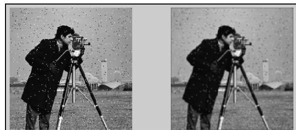
Figure 2 Image corrupted with salt and pepper noise(left) and filtered image(right)

Video de-noising is normally finished some linear or non-linear operation on a group of neighbouring pixels and therefore the correlation between those pixels out there in