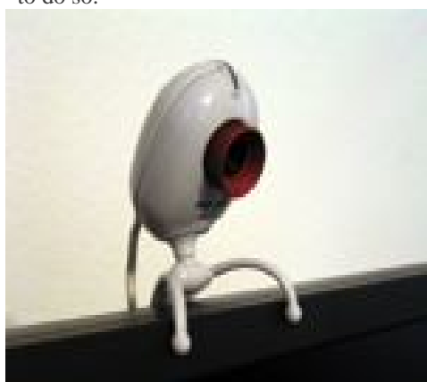
Fig. 2 Webcam

Step 5: Make sure that you follow meticulously the steps of the software program – you'll be installing the drivers that allow your computer to communicate with the webcam. It may be important to plug in the webcam in a certain order with other cables and equipment, so only plug it in when prompted to do so.