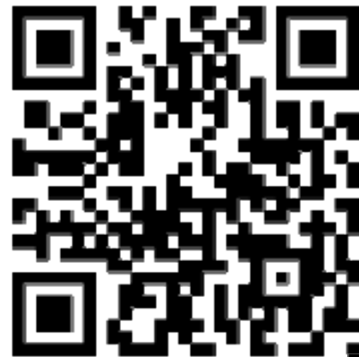
Fig. 1 QR code

of the camera applications, the ability to read or write data, track GPS information, and browser history is required when accessing some data. All this places personal information at risk from fraudulent sites and malicious programs. Near field communication is technology that uses low frequency radio signals embedded in a microchip or smart tag similar to QR codes. Near field communication (NFC) uses technology similar to Bluetooth or Wi-Fi except the data is only able to transmit between very short distances of no more than a few centimetres. It is popular to use mobile phone daily in modern life. Among the numerous applications provided by mobile phone, barcode utility is one of the important branches. Many companies supply barcode tools for mobile phones. For example, Google's mobile Android operating system supports QR codes by natively including the barcode scanner in some models, and the browser supports URI redirection function which allows QR codes to send metadata to the applications on the device. After investigated the supplied applications on mobile devices, most of the products exhibit information accessible to every user. Differ from the traditional applications of QR Code. An offline authentication mechanism for QR codes, based on the technology of visual cryptography, it is possible to check the identity accessing to the QR codes and to control the permission to the protected data.