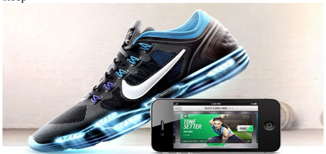
Fig 4: Nike Smart Training Shoes (https://www.google.co.in/)

Also an activity tracker is a device or application for monitoring and tracking fitness-related metrics such as distance walked or run, calorie consumption, and in some cases heartbeat and quality of sleep