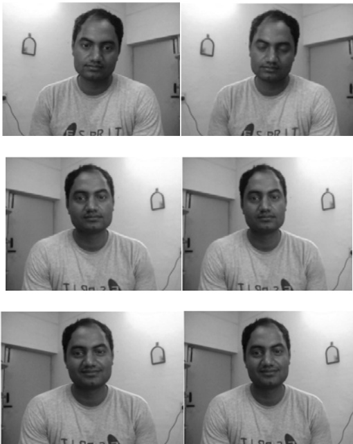
Figure1.3: Some Frames Captured From Different Sign Videos.

Since the aim of this thesis is to count the number of eye blinks automatically, we collected a video database of facial signs to experiment the proposed approach. The frame size of each video is 480x640 and face size varies according to the motion in the video