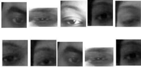
Figure1.2: Open eye templates.

The user is assumed to be blinking at a normal rate of one involuntary blink every few moments. Again, no offline templates are necessary and the creation of this online template is completely independent of any past templates that may have been created during the run of the system.